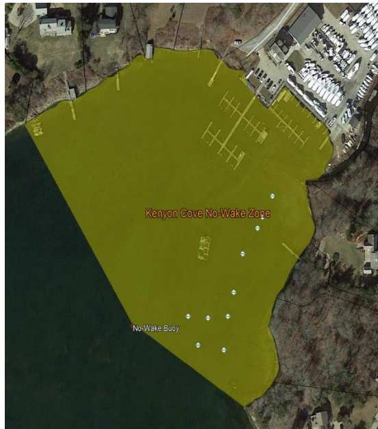
Kenyon Cove, and Ocean House Marina Inland of the No-Wake Buoy.