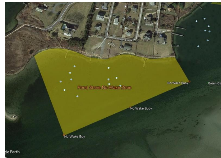
Pond Shore Inland of the three No-Wake Buoys